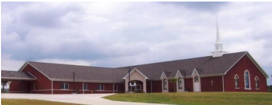
St. Sebastian Church 180 Hwy 136 West Calhoun, KY 42327